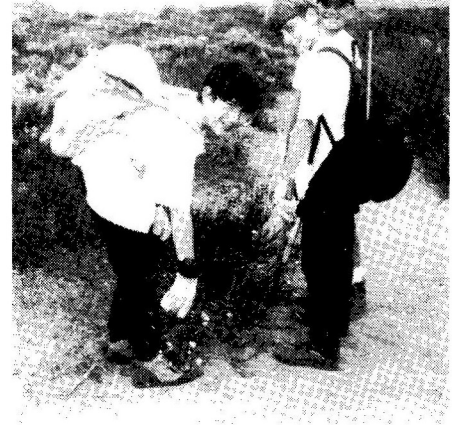
The Sixth Grade Trail Maintenance Team in Action.

SWAP and the Elves take off their hats to this energetic and capable crew of sixth graders!