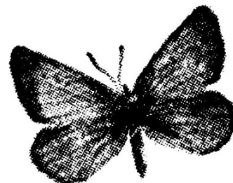
Morro Blue Butterfly

Non-Profit Org. U.S. Postage PAID San Luis Obispo, CA 93402 Permit No. 112